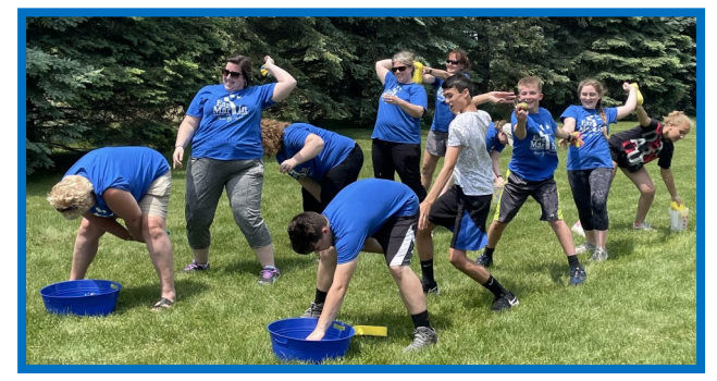
Teachers show students they still rule!

and Fourth Graders spent the last week catching up on their Opinion Writing assignments. They love to write using their laptops!